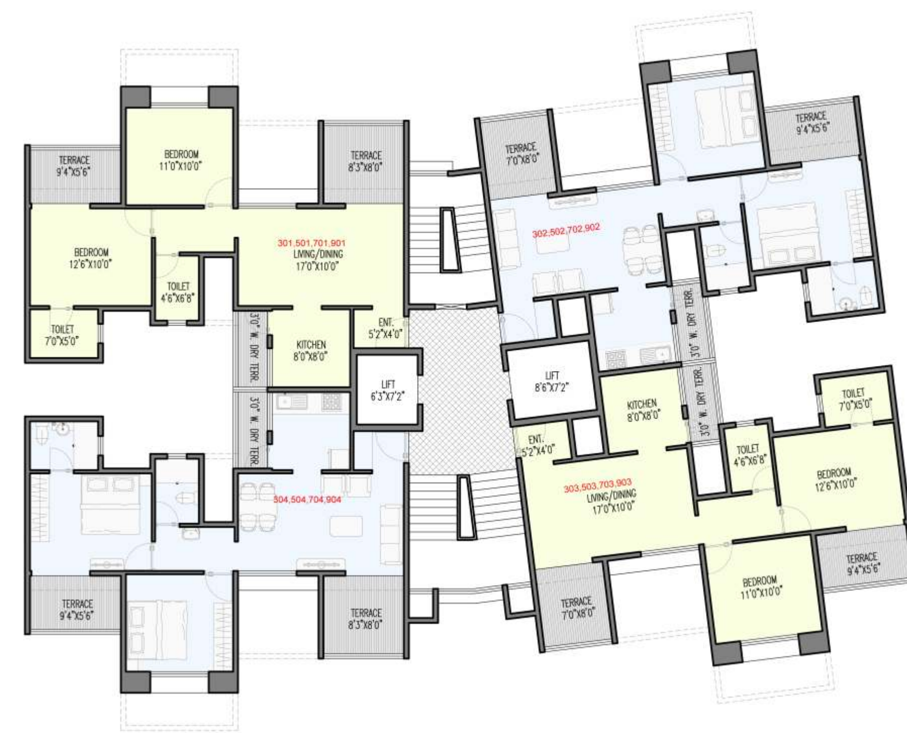
Wing_B_SECOND FLOOR PLAN