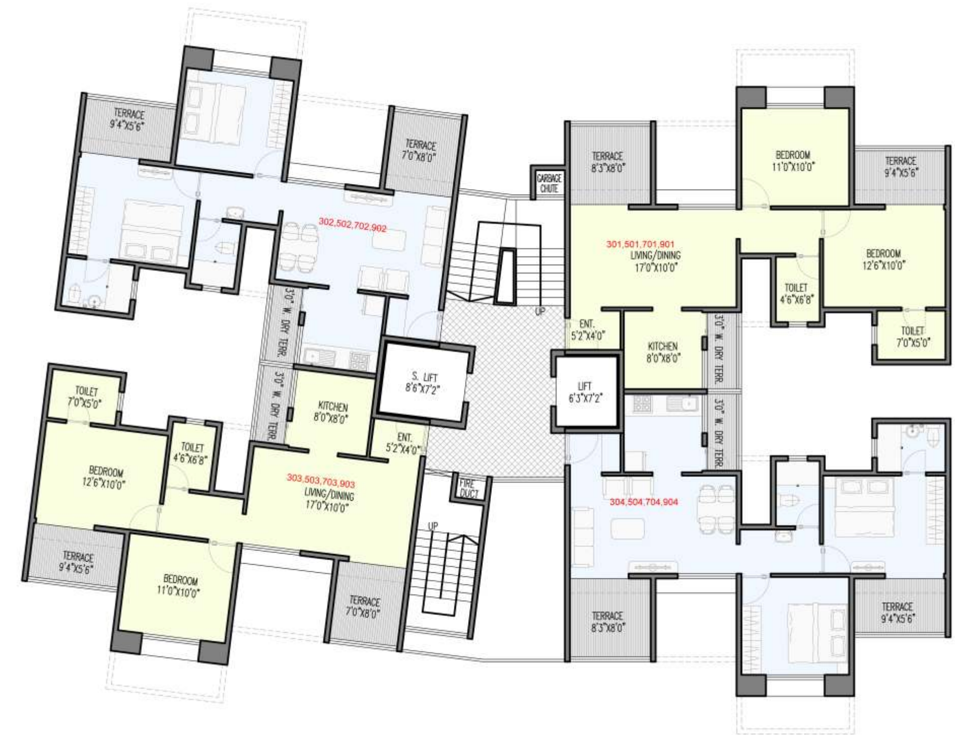
Wing_B_3rd, 5th, 7th, & 9th FLOOR