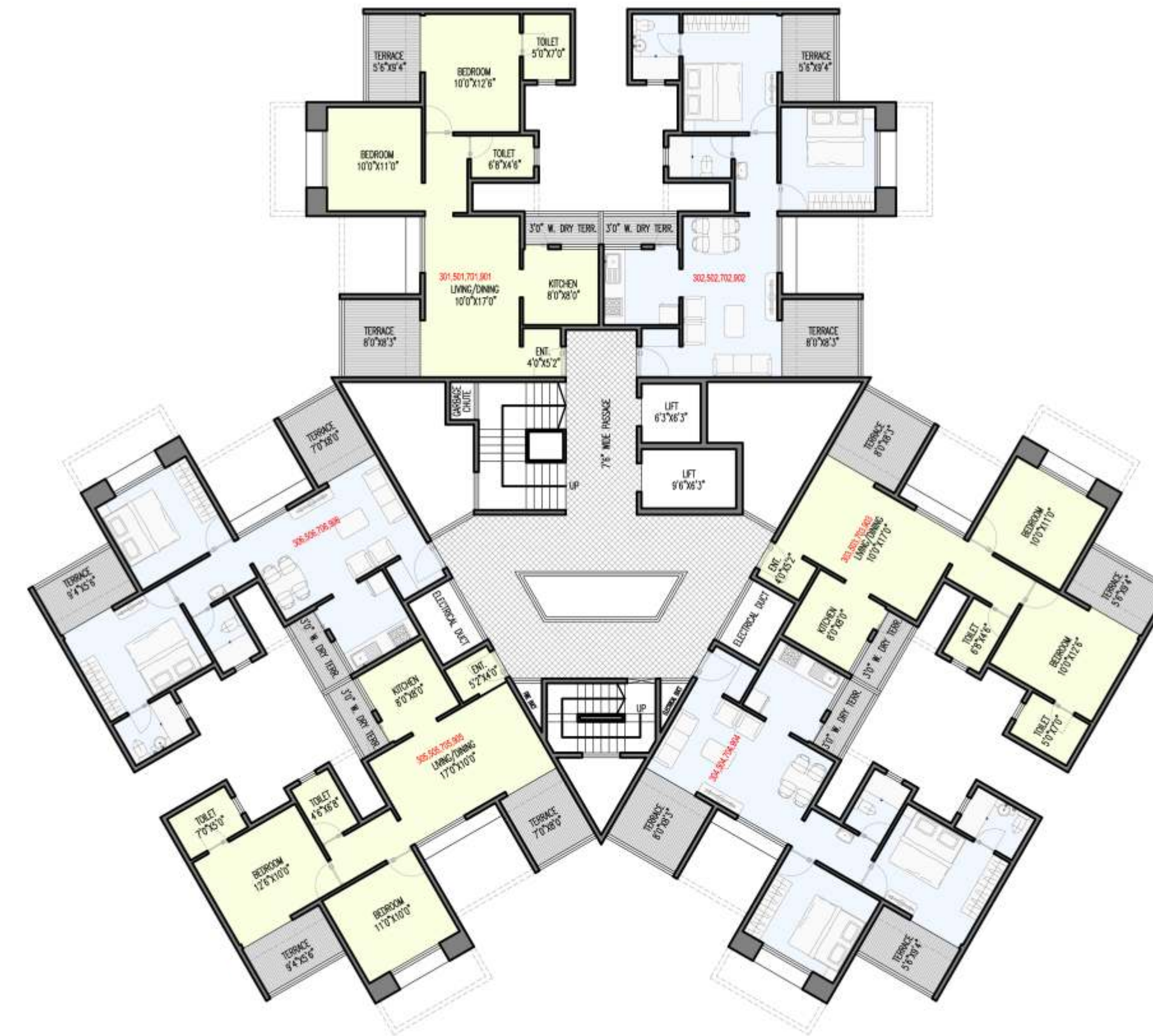
Wing_D_3rd, 5th, 7th, & 9th FLOOR