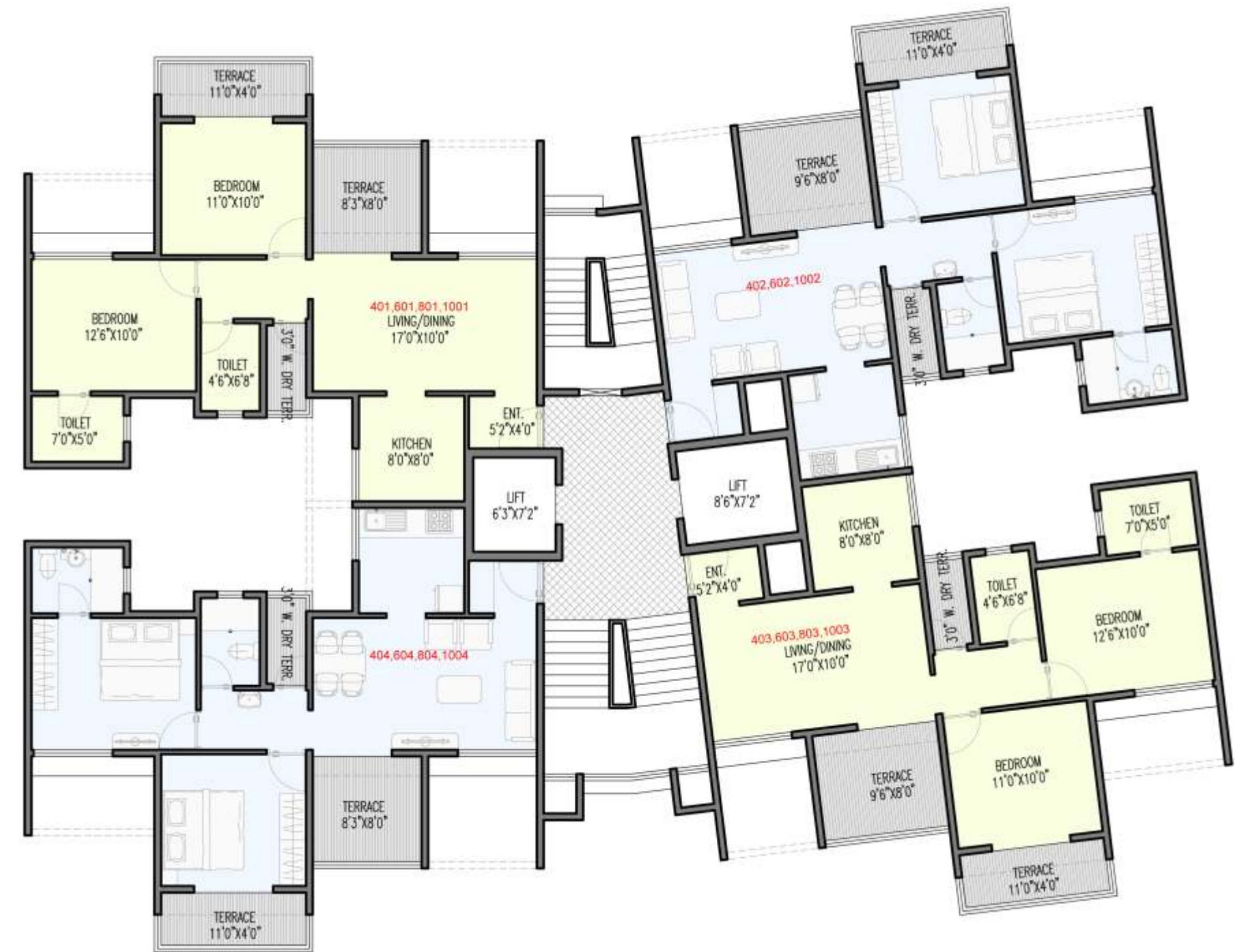
Wing_C_4th, 6th, 8th, & 10th FLOOR