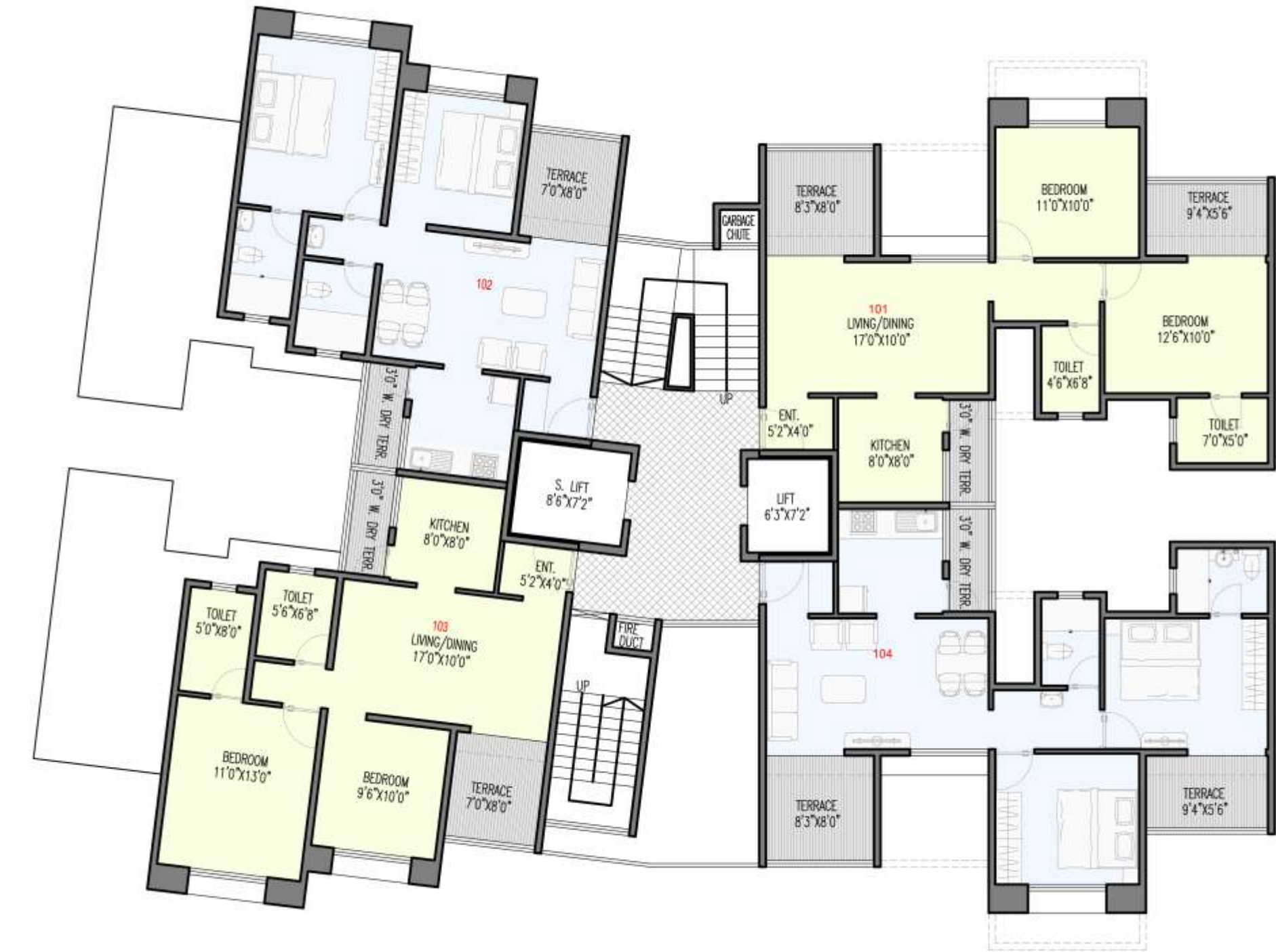
Wing_B_4th, 6th, 8th, & 10th FLOOR