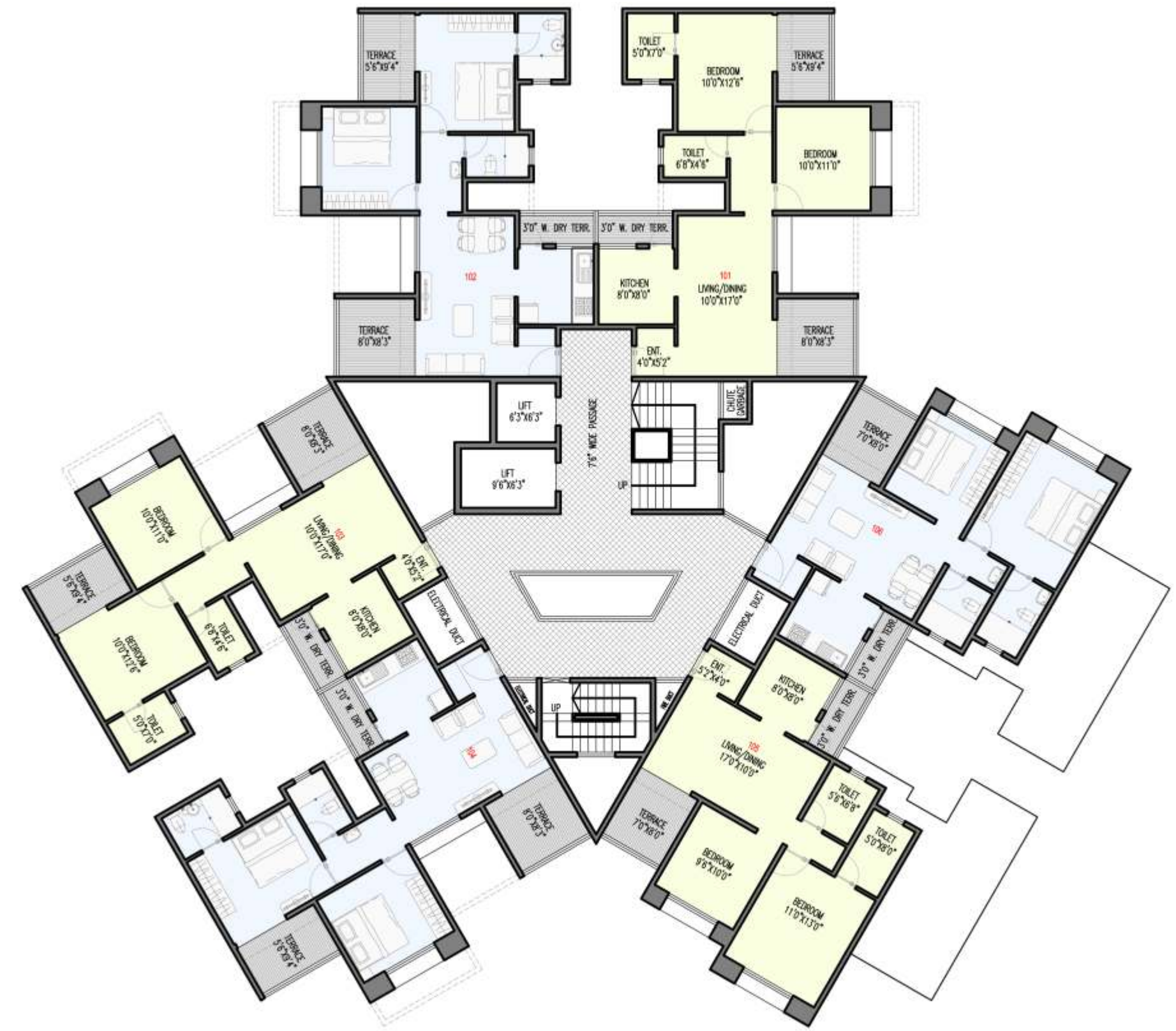
Wing_A_11TH FLOOR PLAN