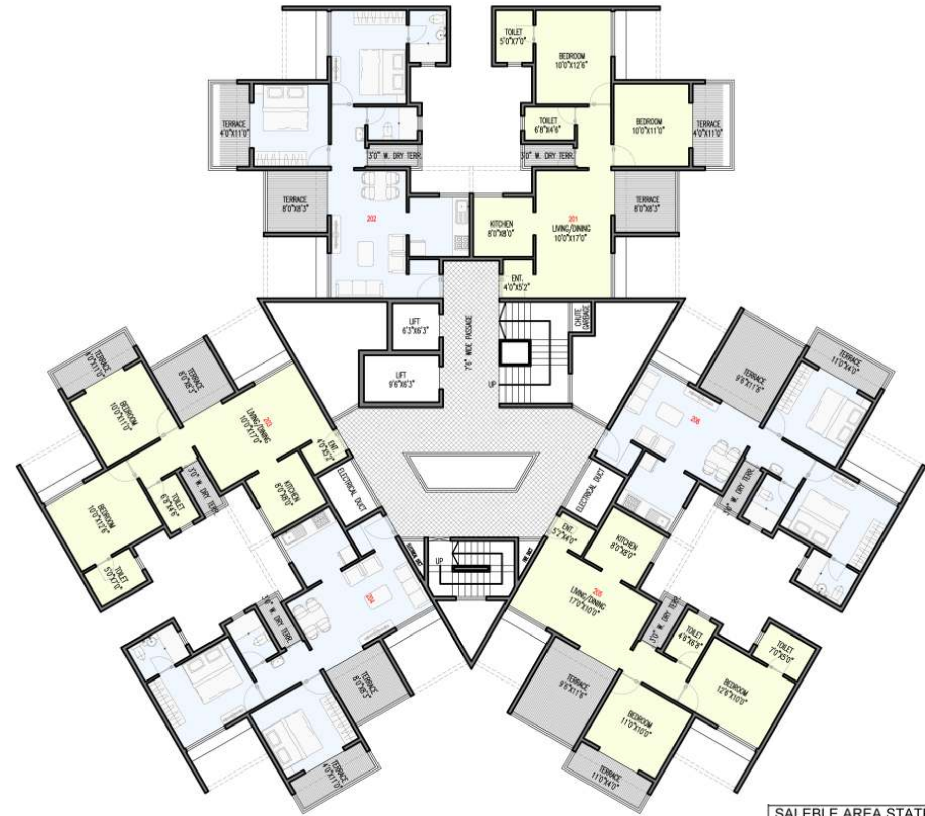
Wing_A_SECOND FLOOR PLAN