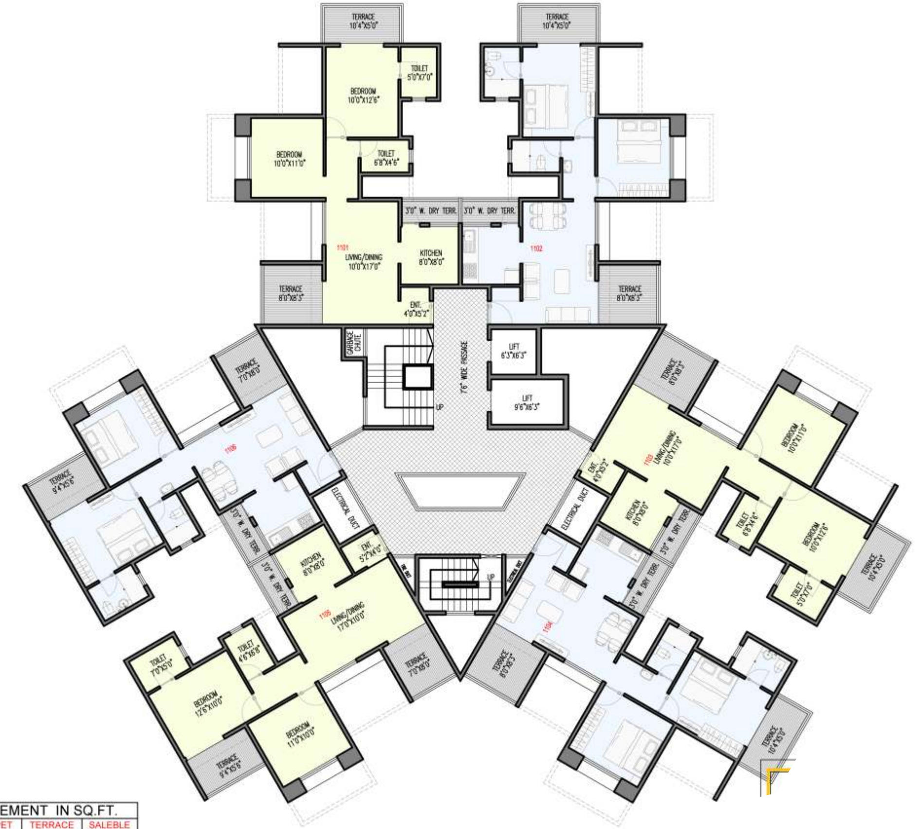
Wing_D_4th,6th,8th, & 10th FLOOR