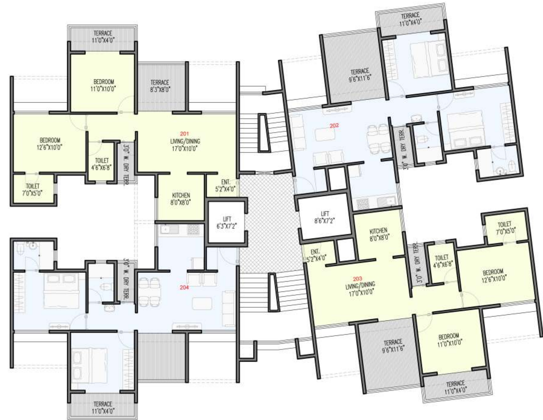
Wing_C_SECOND FLOOR PLAN