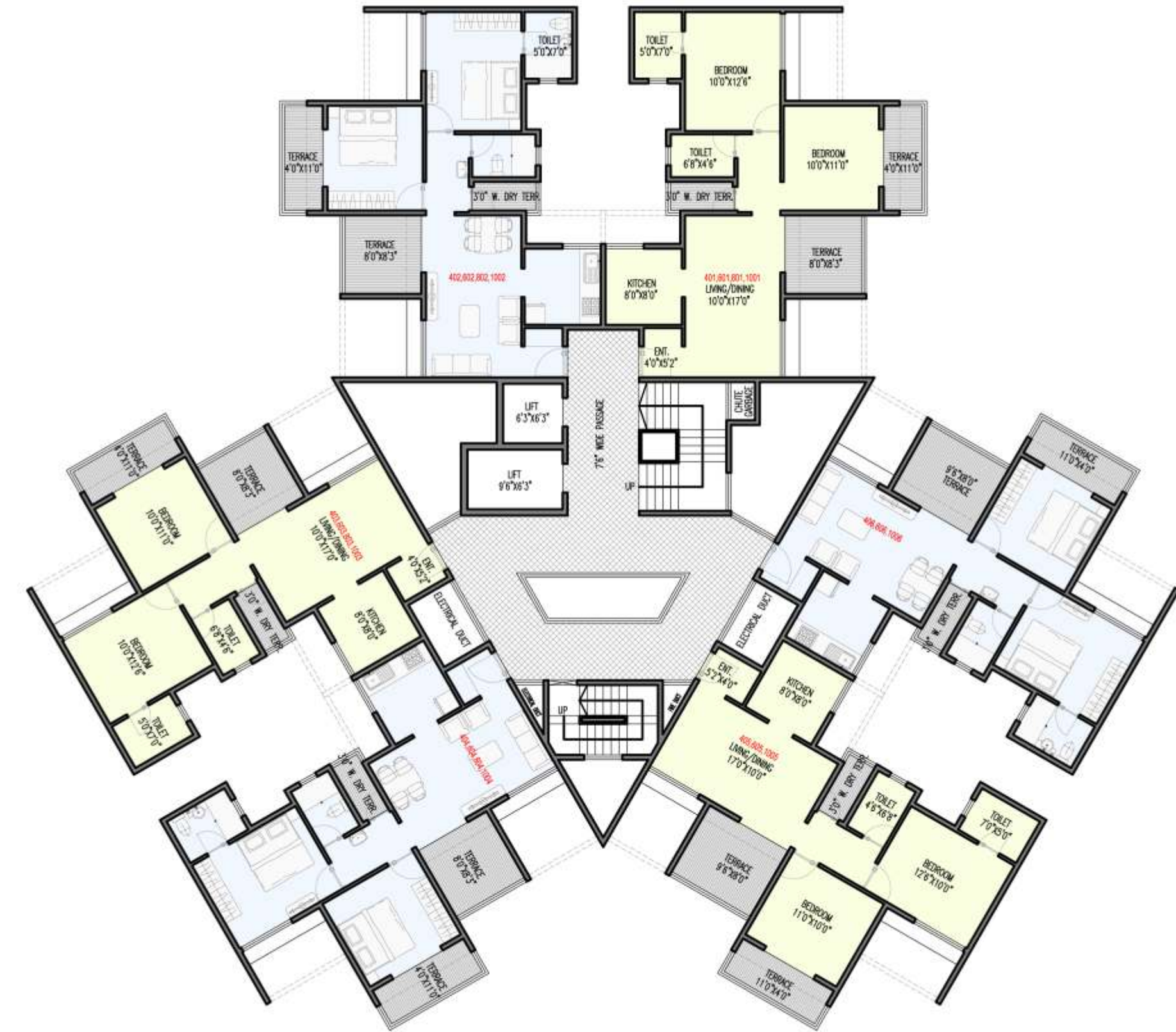
Wing_A_3rd, 5th, 7th, & 9th FLOOR