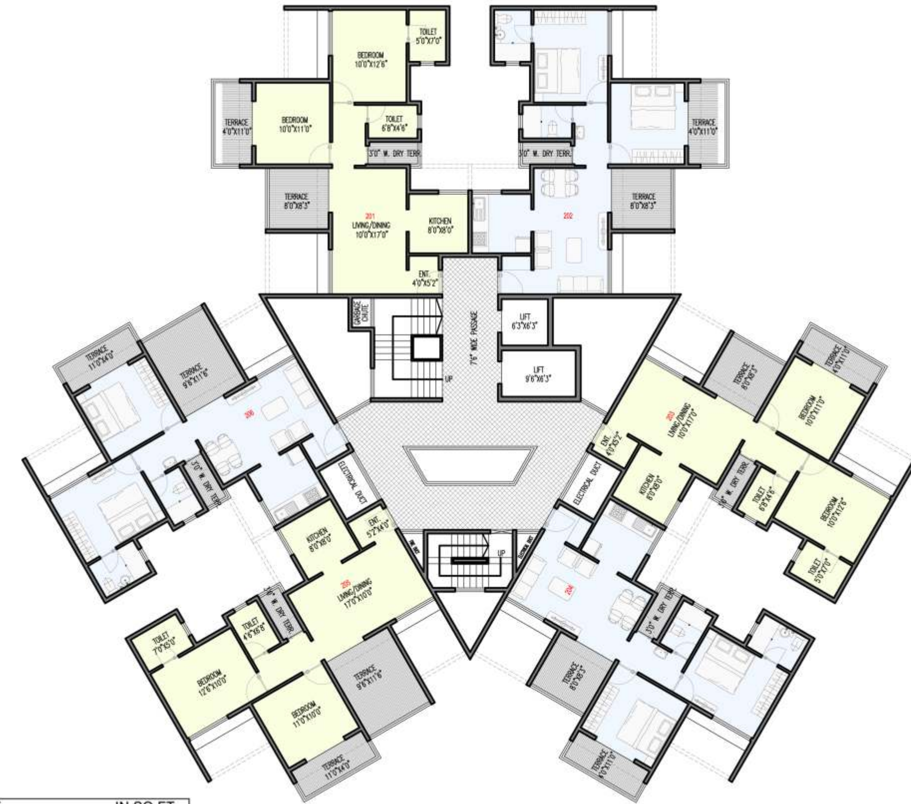
Wing_D_FIRST FLOOR PLAN